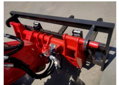
EUROPE ONE QUICK HITCH