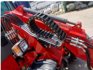
FOUR WAY HYDRAULIC LINE