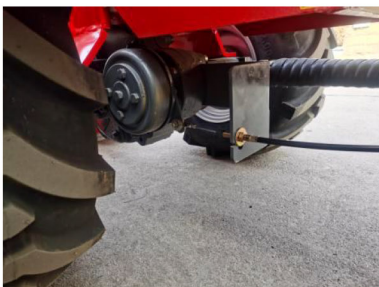
ITALY 25 AXLE