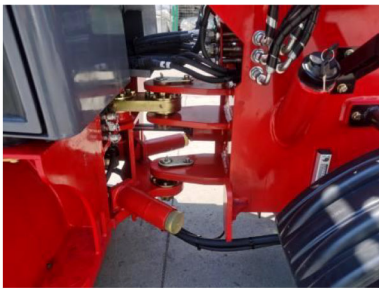
EUROPE LINK FRAMES