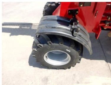
26X1200-16 AG TIRES