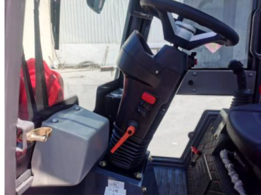
ADJUSTABLE STEERING WHEEL